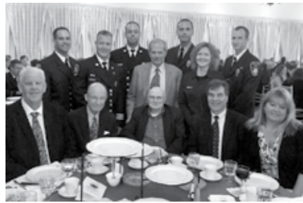
The Branford Exchange Club Honors our Firefighters from Branford, Guilford, and North Branford.