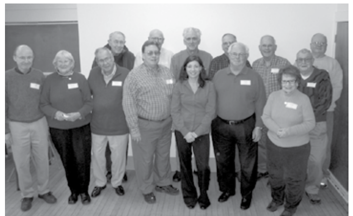
Canoe Brook Team of Drivers - "To the world you are one person, but to one person you could be the world"

A full schedule of holiday and winter activities at Canoe Brook can be found in Canoe Brook Connections our monthly newsletter available at the Center, Town Hall, Libraries, Senior Housing, on our busses, and online at http://www.branford-ct.gov/canoebrook . We look forward to seeing you!